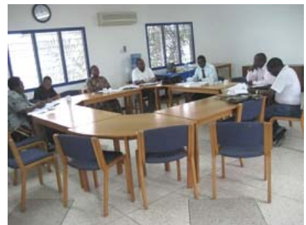
Participants at the TAN executive meeting held in Dar es Salaam recently

They said exchange programmes for local and external experts, producers and farmers within the region and other countries in Africa would help to improve the competitiveness of products on the market.