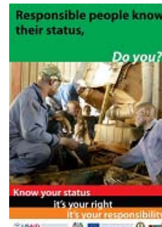
One of the brochures designed as part of a campaign to curb the spread of AIDS

Recently the AIDS Workplace Programmes in Southern Africa (AWISA) Zambia developed three information materials on HIV and AIDS.