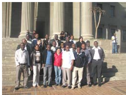
Participants at the regional course on business and open source held in Johannesburg recently

The course built on more than eight practical case studies of African IT companies that use FOSS to generate income, drive innovation, add local value and provide legal, low-cost and high quality software solutions to businesses.