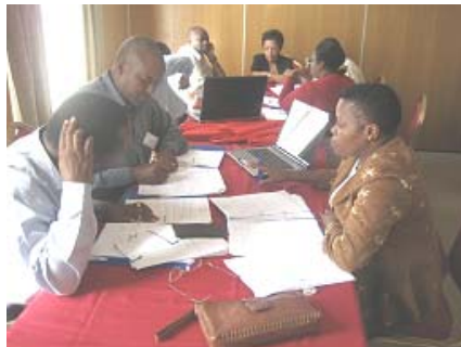
Participants at the module-designing workshop held recently in Mozambique

To commence the module design process, a workshop held in May brought together 28 participants from the Mozambican education, planning, finance and infrastructure sectors as well as from ISAP and GTZ programmes (Education and Decentralisation) to be trained in the POEMA topics.