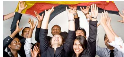
APD - connecting people from across the globe.