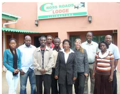
Participants at the Livingstone workshop

She encouraged TAN members especially those from Livingstone to feel free to consult her on matters pertaining to managing NGOs.