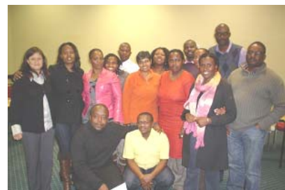
Some of the participants who attended the MONASA workshop in Johannesburg

The quality model focuses on five quality pillars, which includes values, leadership, school improvement plans and communication.